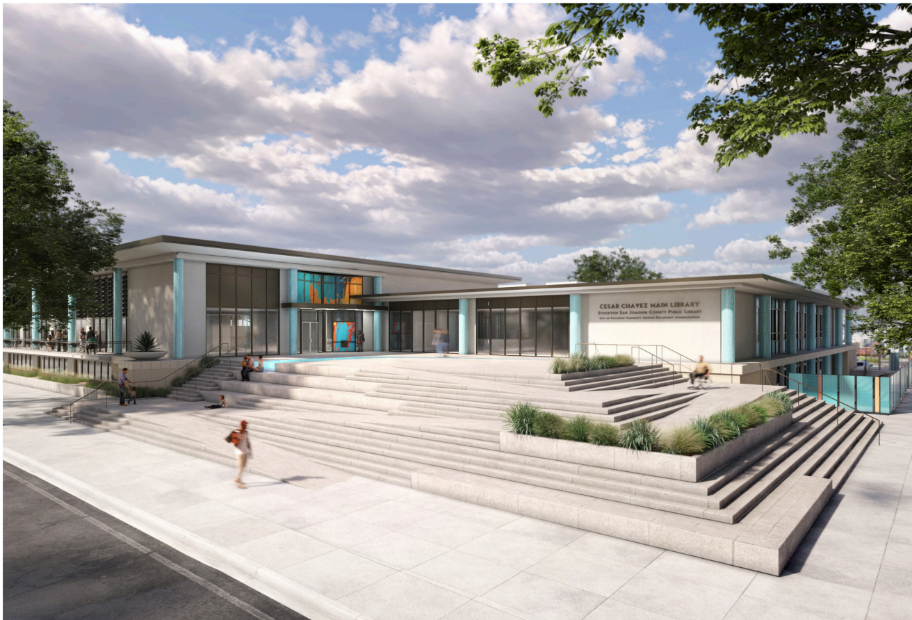
CESAR CHAVEZ CENTRAL LIBRARY