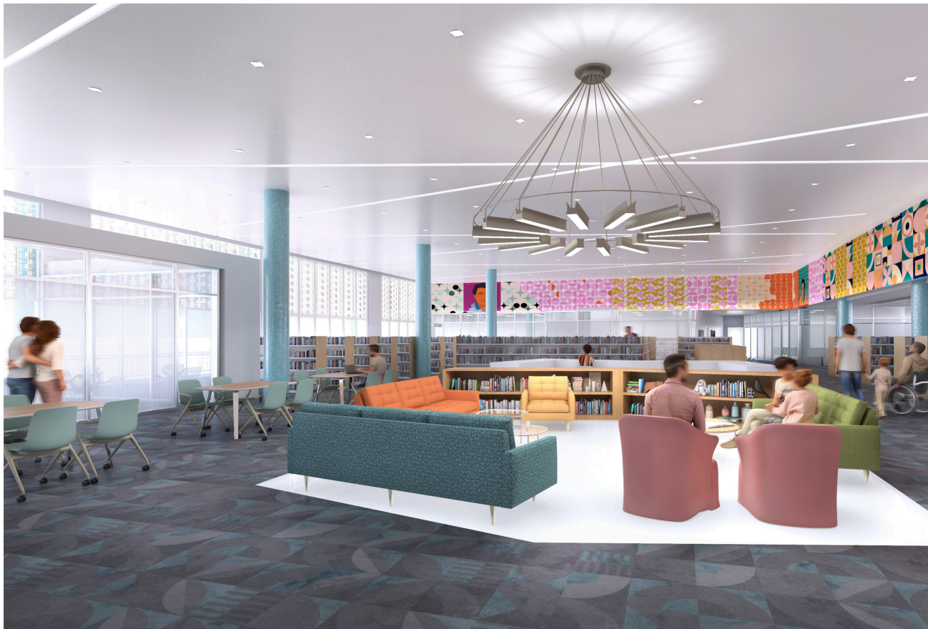
CESAR CHAVEZ CENTRAL LIBRARY

The Stockton-San Joaquin County Public Library - Cesar Chavez Central Library Project was supported in part by funding provided by the State of California, administered by the California State Library.